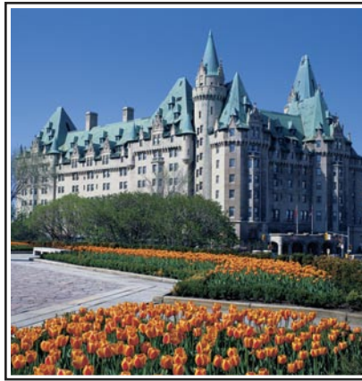
Fairmont Château Laurier, Ottawa, ON

Cancellations: Full refunds will be given for cancellations if notice is received in writing at least five full days prior to the first day of the forum (September 10, 2005). Unfortunately, after that time we are unable to refund registration fees. We reserve the right to cancel, change or revise the date, faculty, content or venue of this event.